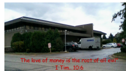
Planned Parenthood Aurora

The leadership of a vigil requires some sacrifice... 40 Days for Life requires a commitment to a Peaceful, Prayerful Presence. This means sacrificing the right to retaliate when hurt people yell hurtful insults.